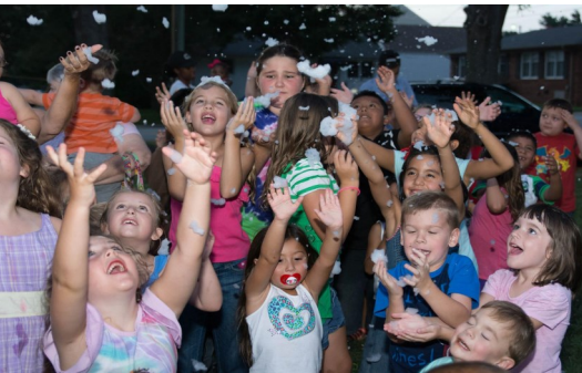
Movies In The Park