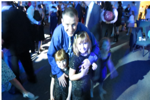
4th of July Fireworks